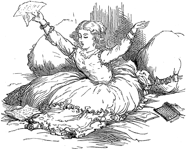
“Shrewd Miss Clippins detected the yawn.”

“He’ll get over it after he’s been married six months,” said Miss Clippins, nodding her head with the air of a woman that has seen life.